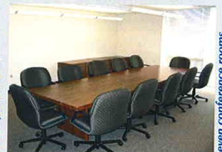
Seven conference rooms