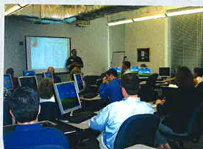
State-of-the-Art Computer Lab complete with 35 fully equipped HP computer stations